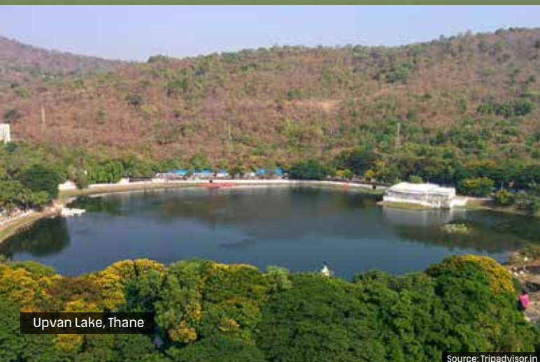
Upvan Lake, Thane