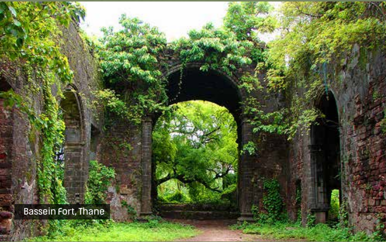
Bassein Fort, Thane